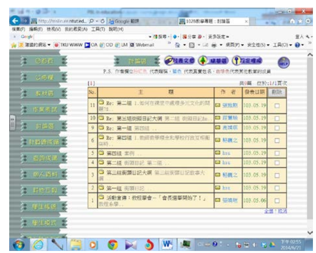
Fig. 2 The scenarios and problems in open cyber classroom platform.

The scenarios and problems for each group in discussion board show in figure 2.